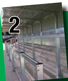
2 EAST ANGLIA SCORES WITH FOOTBALL STAND