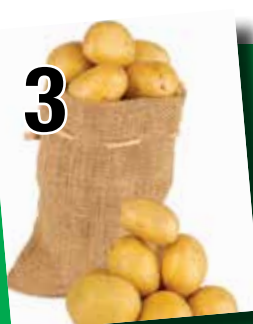
3 WORKSHOP TURNS POTATOES INTO POWER