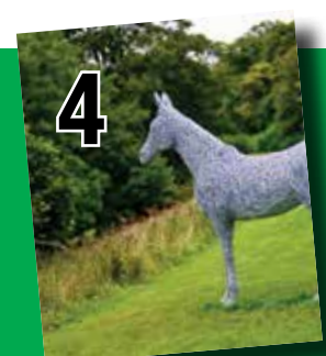
4 NO HORSING AROUND FOR HUMBER