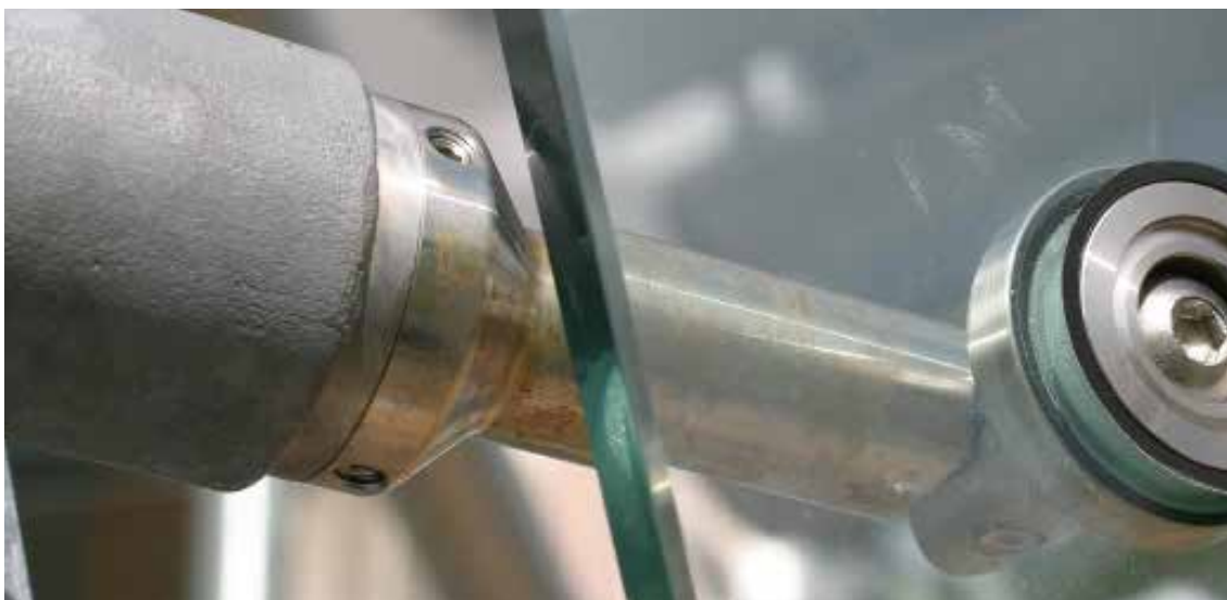
Stainless steel in direct electrical contact with galvanized steel which may result in bimetallic corrosion

Normally any potential for bimetallic corrosion may be alleviated by electrically isolating the two metals from one another. For bolted connections this might be done by using neoprene or plastic washers, while for overlapping surfaces it might be achieved by using plastic spacers or painting one of the surfaces (ideally the more cathodic metal) with a suitable paint system.