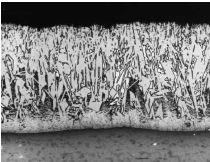
Fig 2. Microstructure of the thick coating obtained using a high silicon steel

this process the coating growth rate is greater than normal and in some cases the entire coating may consist of zinc-iron alloy layers. In such cases the total thickness of the coating is also usually significantly greater than normal (Fig 2.) Due to its increased thickness, the coating gives longer protection from corrosion but a very thick zinc-iron alloy layer can be associated with an increased potential for mechanical damage. Articles with very thick coatings