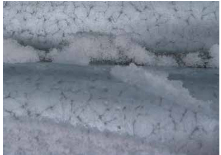
Fig 3. Grey cellular appearance of the zinc coating

should be handled more carefully to minimise the risk of mechanical damage. Certain elements, in particular silicon (Si) and phosphorus (P), in the steel surface can affect hot dip galvanizing by prolonging the reaction between iron and zinc. Therefore, certain steel compositions can achieve more consistent coatings with regard to appearance, thickness and smoothness. The prior history of the steel (e.g. whether hot rolled or cold rolled) can also affect its reaction with molten zinc. Where aesthetics are important or where particular coating thickness or surface smoothness criteria exist, specialist advice on steel selection should be sought from Galvanizers Association prior to fabrication of the article or hot dip galvanizing. BS EN ISO 1461 states: 'The occurrence of darker