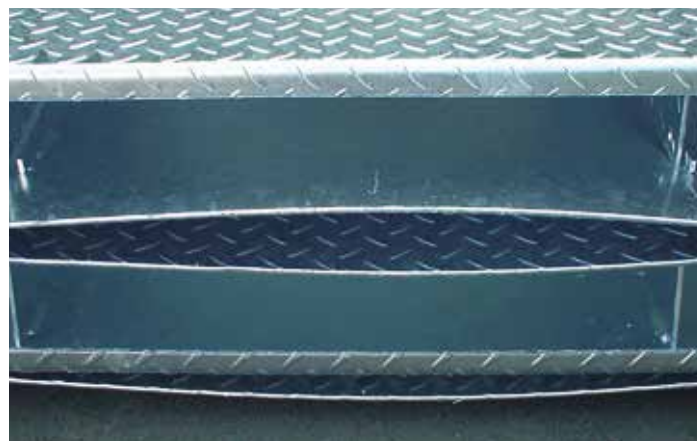
Fig 2. Distortion of thin section checker plate

There is always some potential for an article to distort during the hot dip galvanizing process. However, by taking suitable precautions it is normally possible to prevent distortion from occurring in the vast majority of cases.